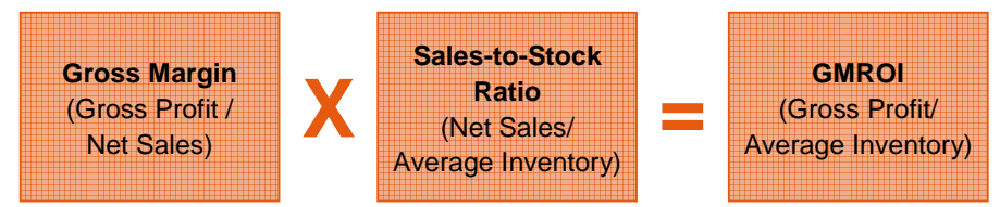
Exhibit 1: Gross Margin Return on Investment Calculation

The GMROI calculation makes intuitive sense, hence its strong appeal. The aggregate gross margin for a particular inventory category multiplied by the inventory turnover for that category yields a percentage that represents the gross margin return for every dollar invested in inventory. That is, for every dollar invested in inventory the amount of contribution made to overall profitability. Too often the gross margin and inventory turnover are looked at in isolation.